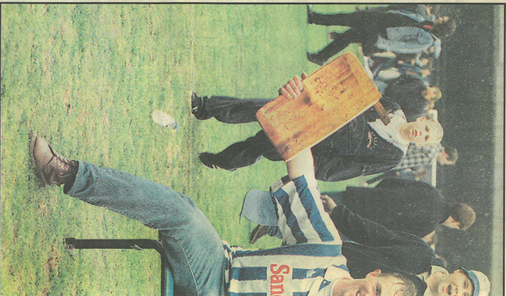
KING OF ALL I SURVEY: Colin Powell ignores the downpour as