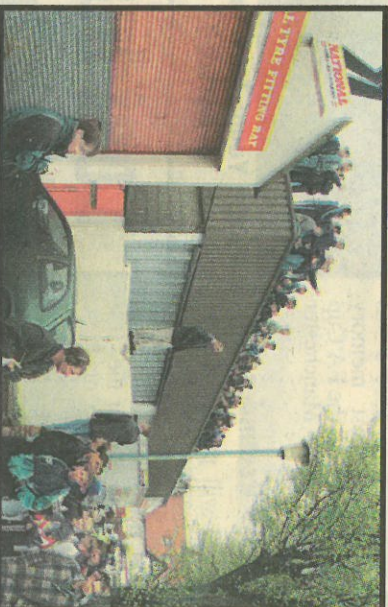
ROOFTOP VIEW: Car rental firm takes the weight

AN estimated 1,000 loyal Albion fans turned up to the Goldstone, knowing they had no chance of getting in.