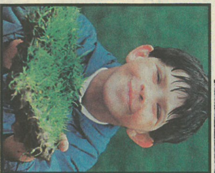
MINE: Young fan's handful of history