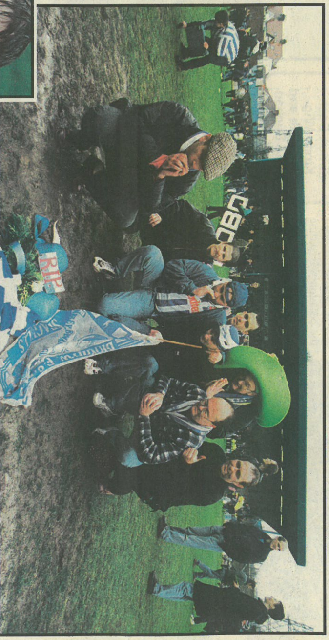
WAKE IN THE RAIN: Hardly a dry eye in the house as these fans gather on the centre spot