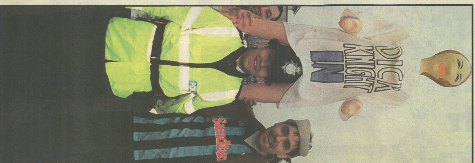
HELLO DOLLY: Fans in the carnival spirit