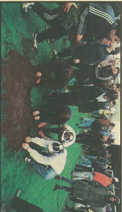
TURF LUCK: Fans dig in and dirty their hands in the souvenir hunt