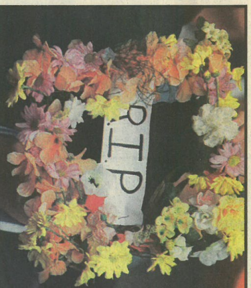
WREATHED IN TEARS: Home-made tribute