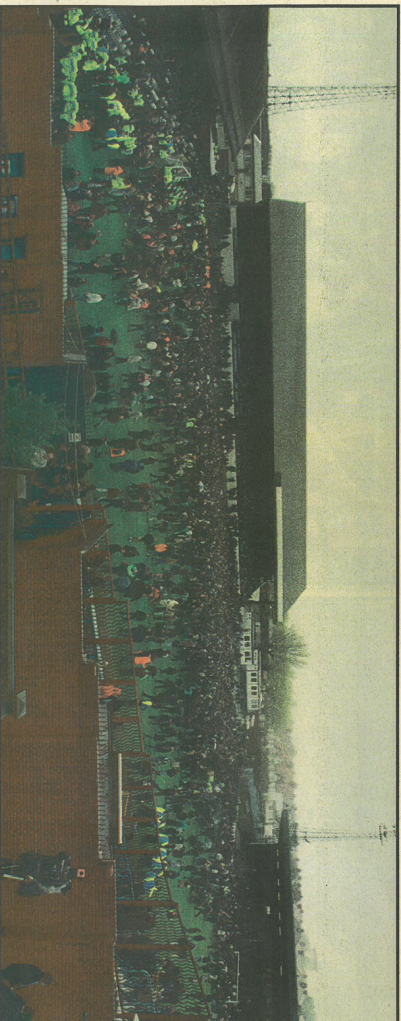
IT'S ALL OVER NOW: Seagull fans swarm on to the pitch in search of mementos and to share memories and experiences on a never-to-be-forgotten day